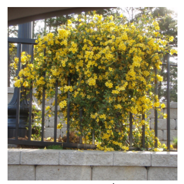
Carolina Jasmine/Jessamine Gelsemium sempervirens