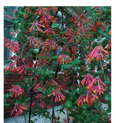
Coral Honeysuckle Lonicera sempervirens

Evergreen perennial Vine: 12-36' – great for arbors Blooms: red - yellow March-June Sun – part shade Prefers good air circulation Attracts bees, butterflies and hummingbirds Fruit attracts birds.