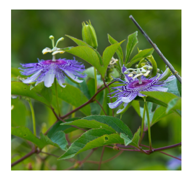
Passion Flower Passiflora incarnata