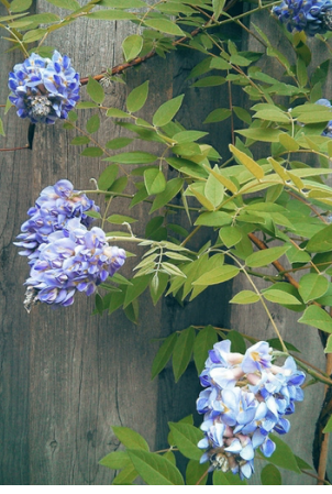
Wisteria Wisteria floribunda

Popular ornamental - clings to supporting plants or structures by counterclockwise-twining stems Flowers have distinctive fragrance