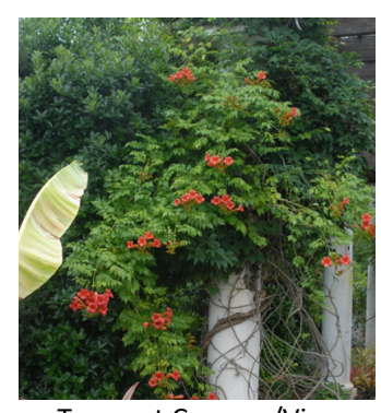
Trumpet Creeper/Vine Campsis radicans