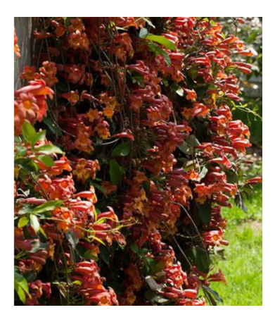
Crossvine - Bignonia capreolata

Semi-evergreen perennial Vine: 36-50' Blooms: orange-red - yellow March - May Sun - part shade – best in sun Avoid crowding of stems. Nectar source for hummingbirds and butterflies Deer browse it in winter.