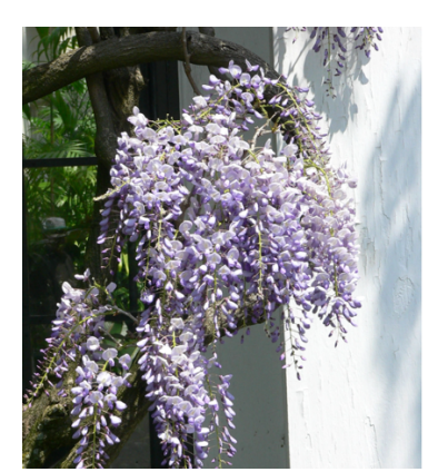
Wisteria – Wisteria frutescens

Deciduous perennial Vine: 12-36' Blooms: white to pink, blue, purple, violet -- May-June Fragrant blooms Sun - part shade – shade Can be trained on walls, arbors Attracts butterflies Nectar source & larval host Deer resistant